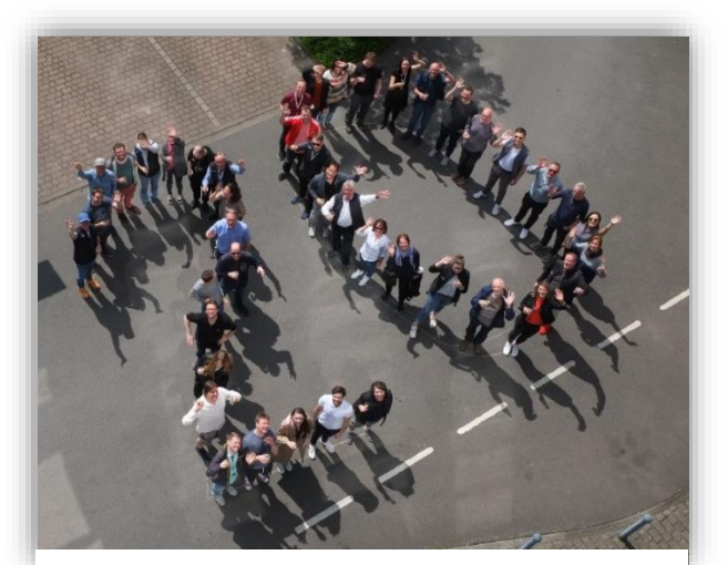
TOPTICA eagleyard staff in May 2022

"I am particularly proud of the working atmosphere at our company. We work very cooperatively as well as being friendly and understanding - and that's where I recognize my signature.