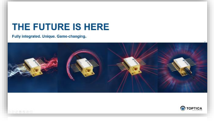
Four new products in 2022

"We've outgrown our current premises - I think that says quite a bit about our success. We are expanding and will soon be moving to another building. At the same time, we are